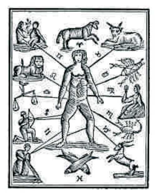
The Zodiacal Man Aries is shown 'ruling' the head

These are two important lessons of Aries.